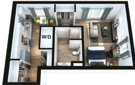
A2 Studio / 1Bath $1,850 - $1,900 501 SF