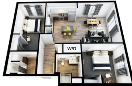
C2 2 Bedroom / 2 Bath $2,950 - $3,150 1,021 SF