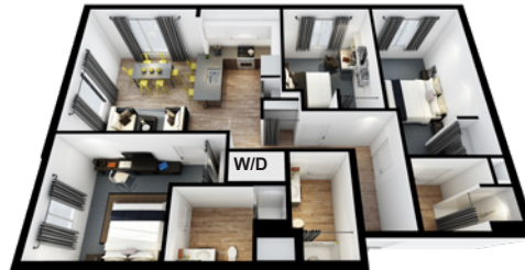
D2 3 Bedroom / 3Bath $4,200 - $4,425 1,247 SF