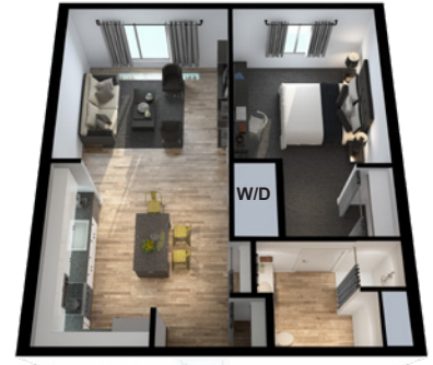
B 1 Bedroom / 1 Bath $1,850 - $1,975 663 SF