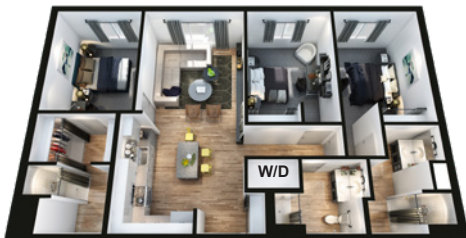
D 3 Bedroom / 3Bath $4,200 - $4,425 1,200 SF