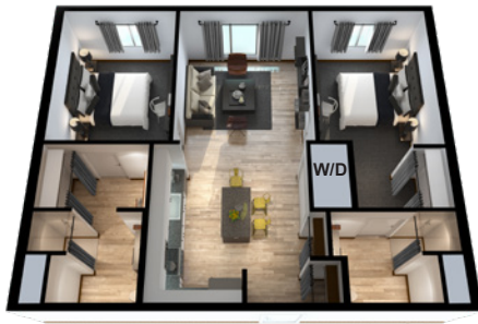
C 2 Bedroom / 2Bath $2,950 - $3,150 901 SF