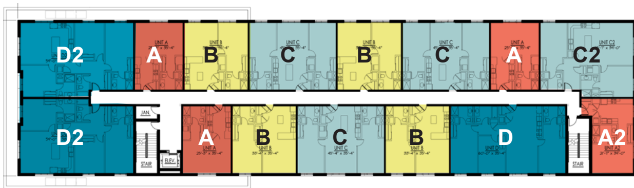
3rd and 4th Floor