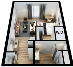
A Studio / 1Bath $1,850 - $1,900 501 SF